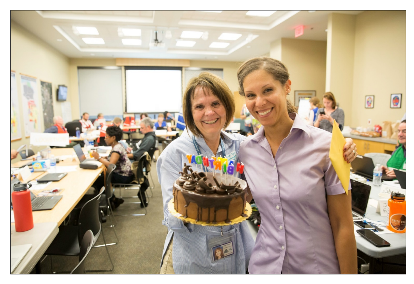
Two MultCo PIO's spent their birthdays working at the JIC